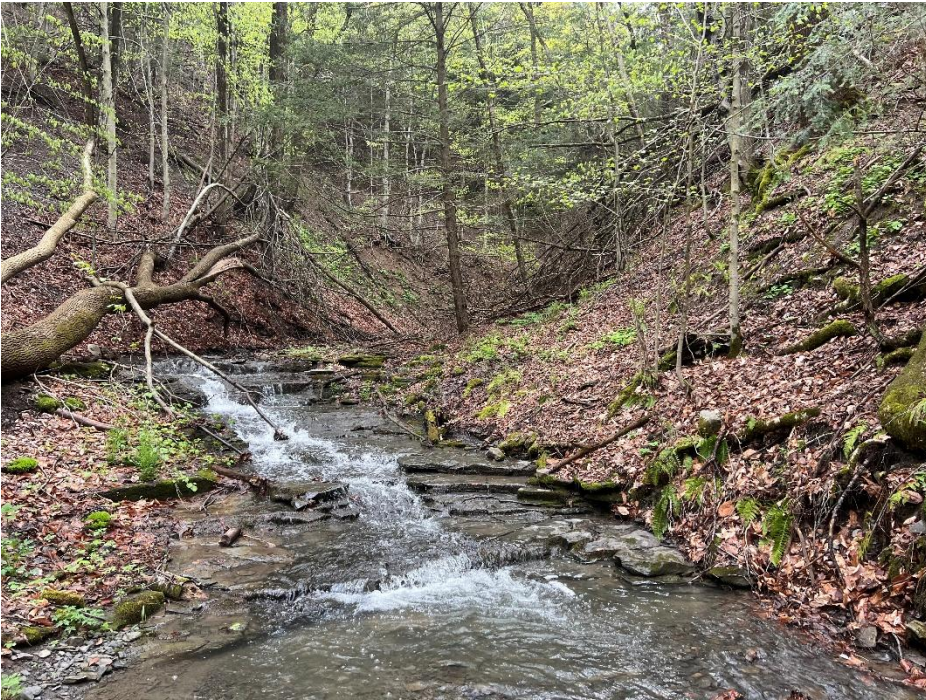
FLTC's new DeRuyter property contains a scenic gorge beloved by hikers.

Great news! The Finger Lakes Trail Conference has purchased a parcel in DeRuyter to protect a key trailhead for hikers of the Onondaga Trail. Over twenty years in the making, this purchase will allow FLTC to place a trail easement granting access for hikers...forever.