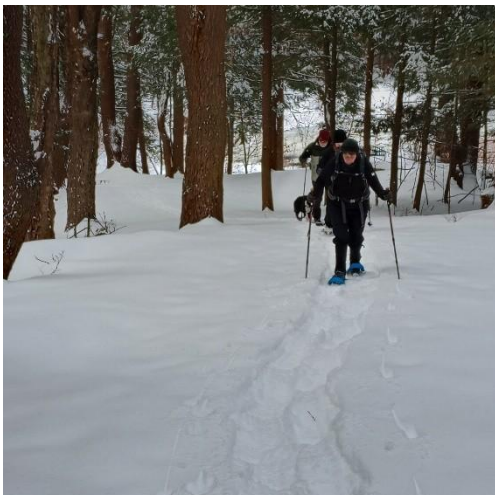
Snowshoeing at Forest Park, Camden, NY