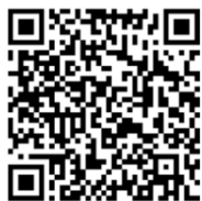
HWA Data Point Collection Form

Those interested in participating can register using the following link: Registration Form HWA Here is some additional Training Material