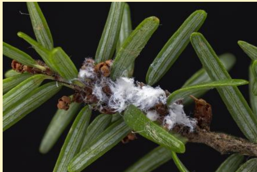
The Hemlock Woolly Adelgid at work.