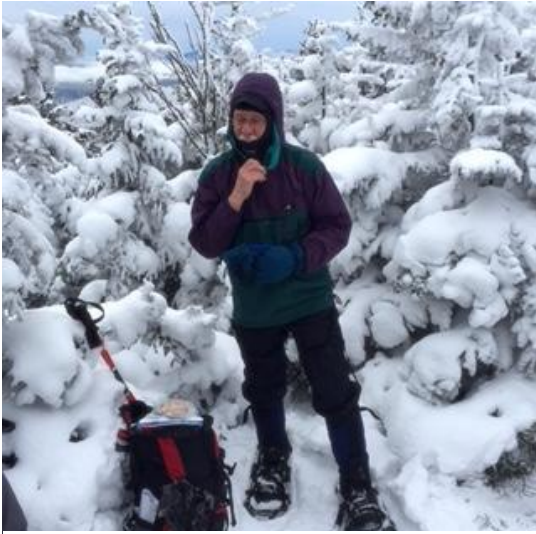
As the colors fade and the air turns crisp, there's still plenty to enjoy in the great outdoors.