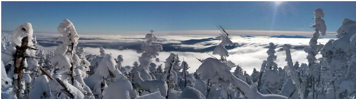
From a hike up Old Spec Mountain in Maine.

Here's wishing you happy holidays and hope to see you out on the trails — whatever the season brings!