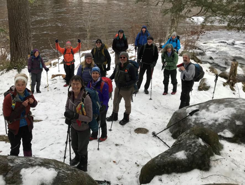
The OK Slip participants on a side trip to the Hudson on January 14, 2023. Who stood here before us?